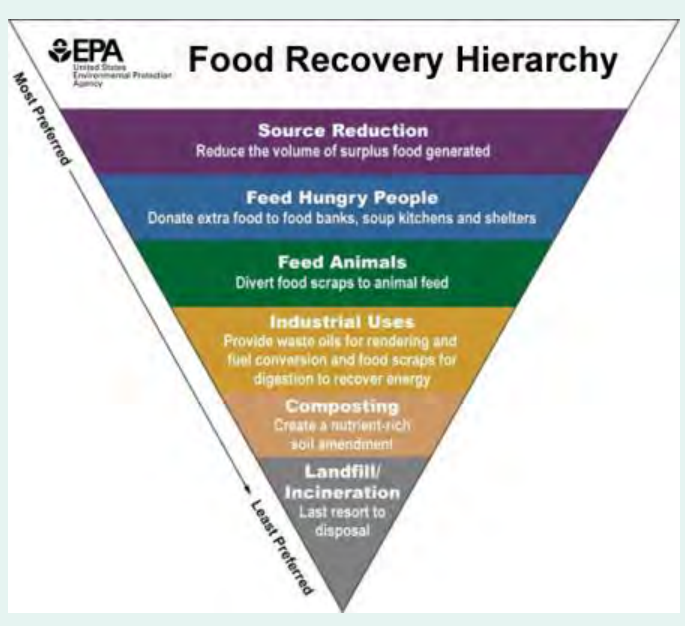
Food Recovery Hierarchy courtesy of the Environmental Protection Agency. Retrieved from: https://www.epa.gov/sustainable-management-food/food-recovery-hierarchy

Supermarket policies influence supply chains as well as customer habits, and function as a gatekeeper to food purchasing (Davies, T. 2000; Smith, B. G. 2008). Improved in-store policies such as standardizing date labeling,